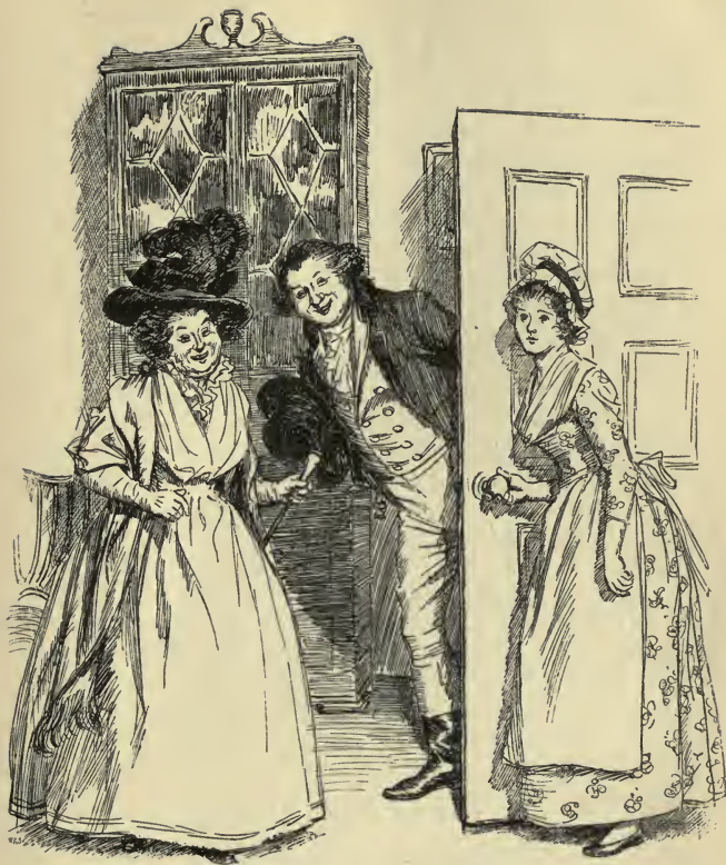
Came to take a survey of the guest.